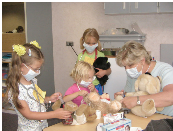
No longer just checking teddy bear's health (as at Head Start's Teddy Bear Picnic last year). CC-V MHC scheduled for Fall 2008.

Student enrollment for CCV MHC will occur at school registration in August, with additional information available. Registered students and their siblings, birth through 21, will be eligible. CCV MHC will have a tempo-